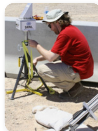
Sample collection device deployed in the field